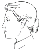
STRAIGHT HAIR STYLE WITH BUN CHEVEUX TRÉS EN CHIGNON