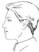
SHORT HAIR STYLE CHEVEUX COURTS