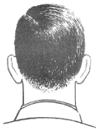
TAPER TRIMMED HAIRCUT CONVENTIONAL COUPE DE CHEVEUX MARIÉE CONVENSIONNELLE