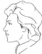
CURLED HAIR STYLE CHEVEUX FRISÉS